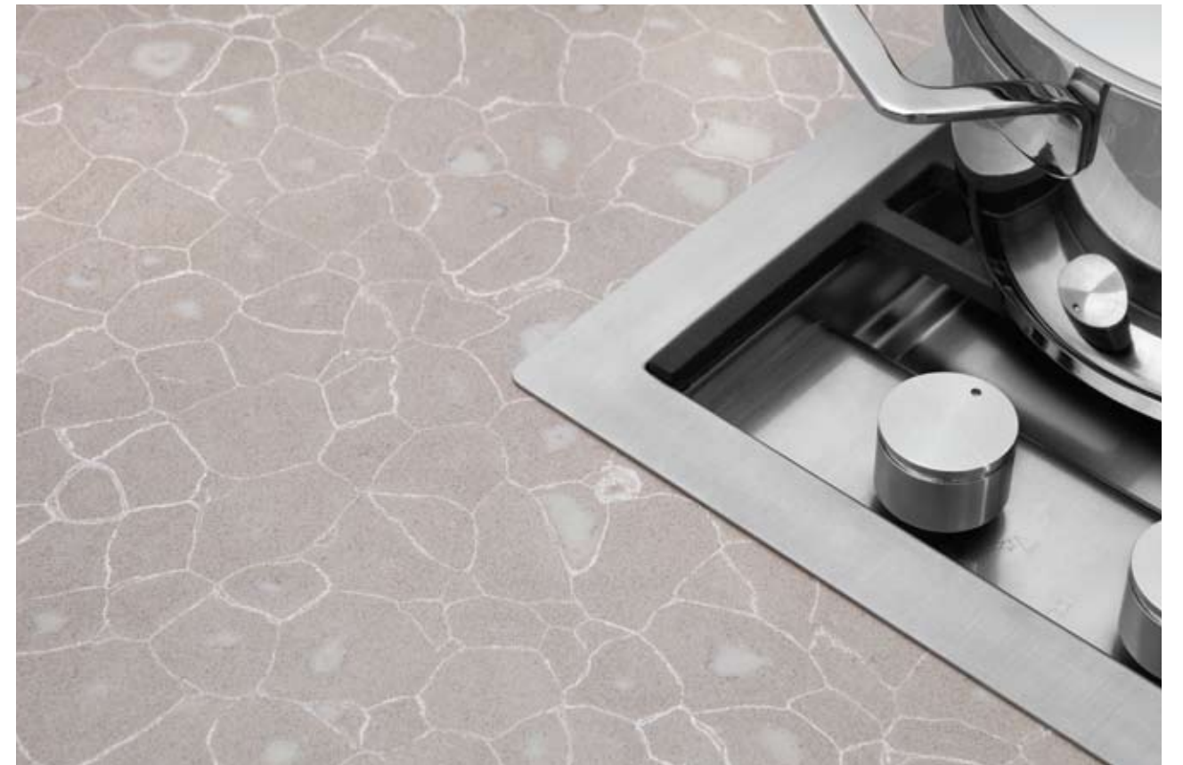
1050 Shining Armor, countertop