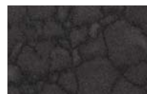
1150 Queen of Sheba