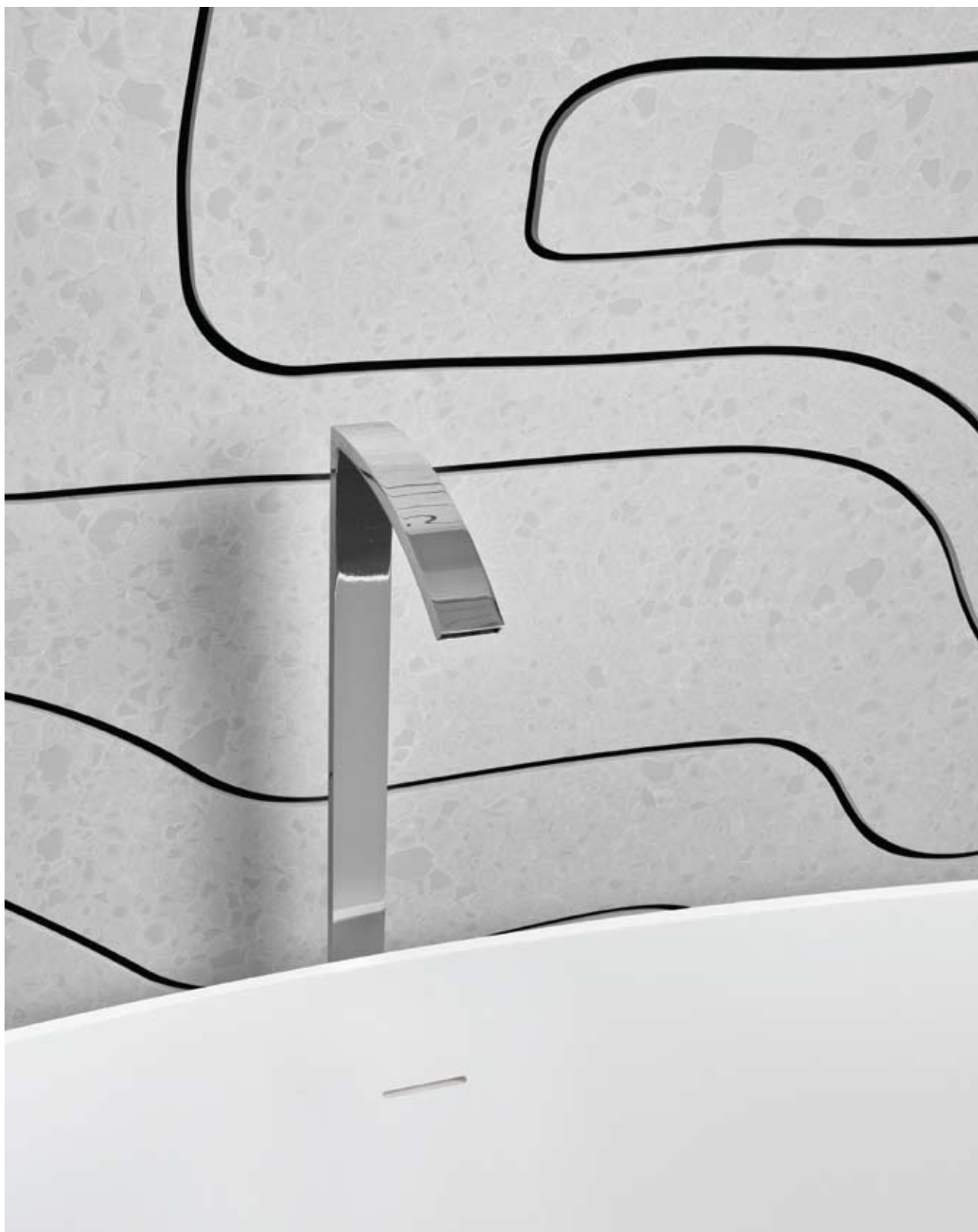
1600 Swan Lake, wall paneling