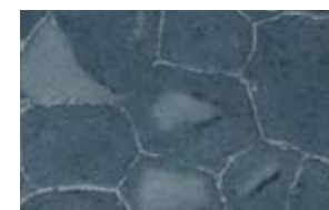
1550 Ocean Palace