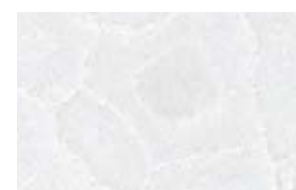
1600 Swan Lake

*Shade and graining of actual product may vary from printed sample.