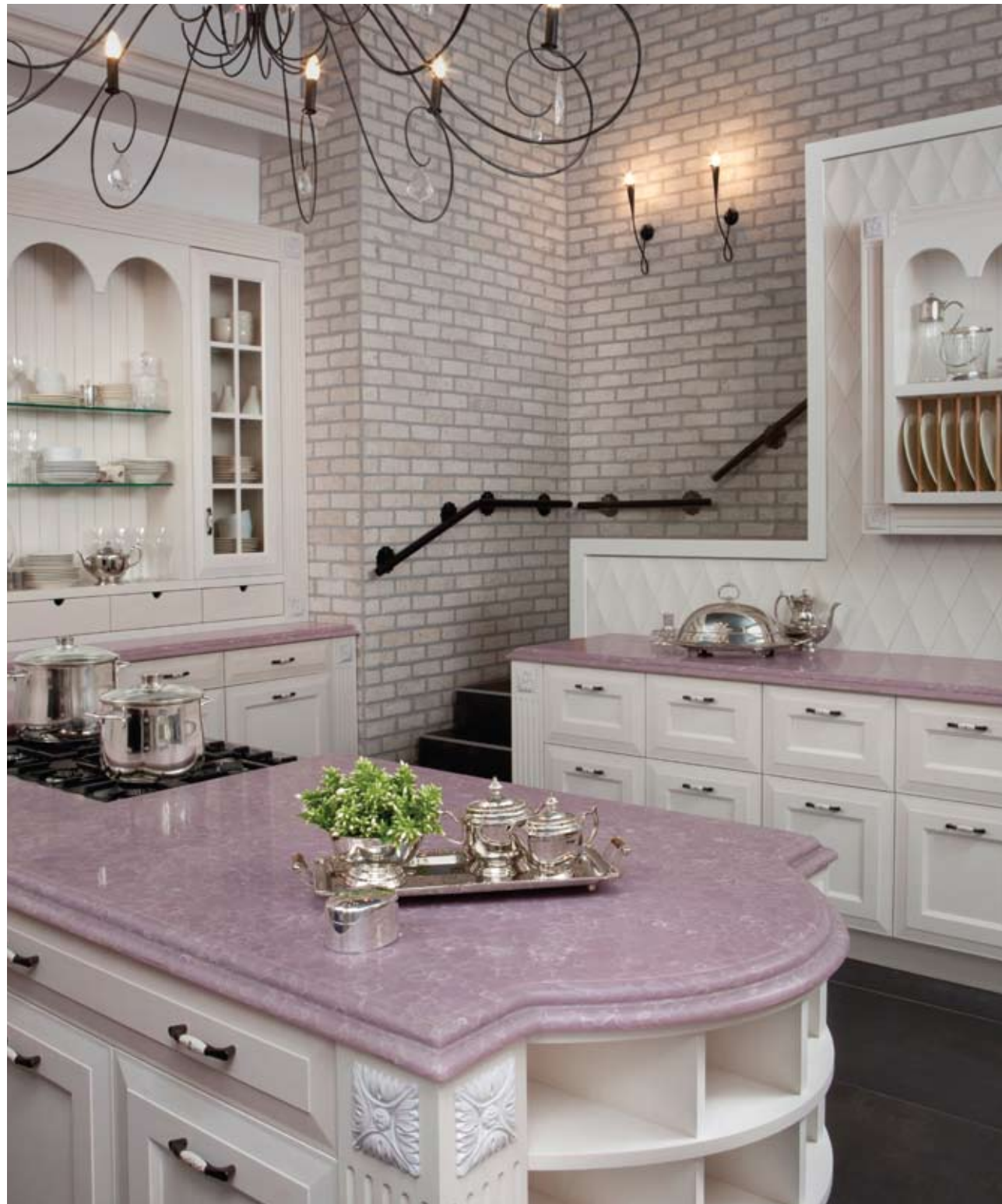
1420 Queen of Hearts, countertop & island

Supremo™ quartz surfaces are not only beautiful to look at and unique in design, but also superior in durability. Non porous, safe and hygienic, they are also easy to care for – there's no need to seal, polish or wax - all that's needed is a mild cleaning detergent and surfaces will maintain their long lasting luster.