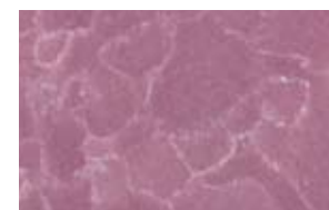
1420 Queen of Hearts